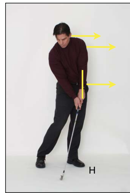
Hip/Body/head slide forward