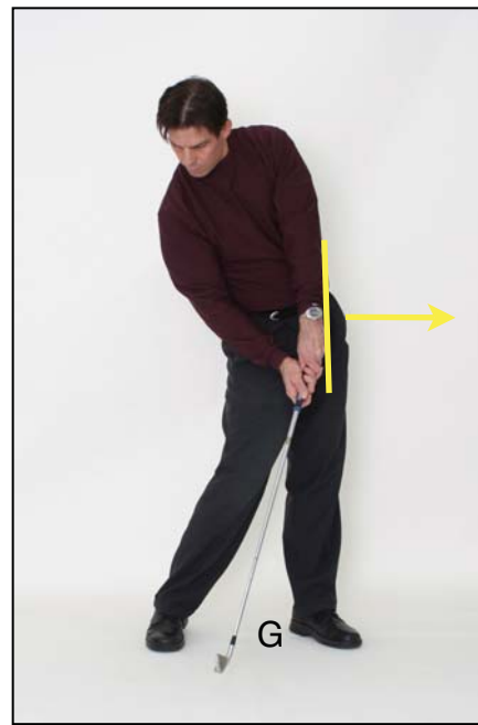
Hip sway forward