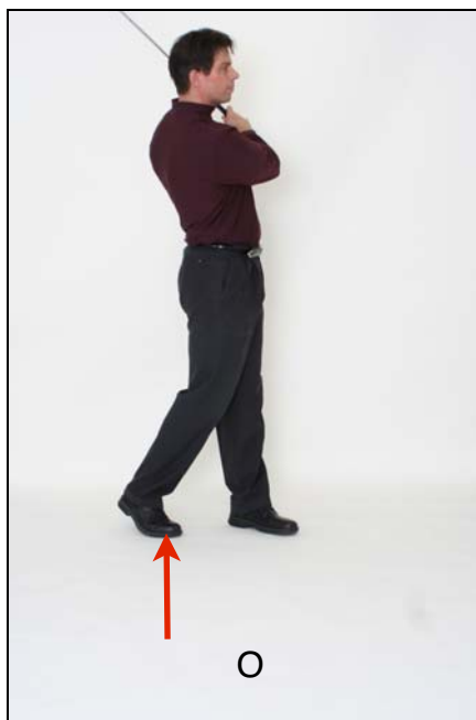
Non transfer of wt to front foot at finish