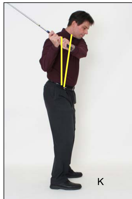
Back Swing Loss of spine angle