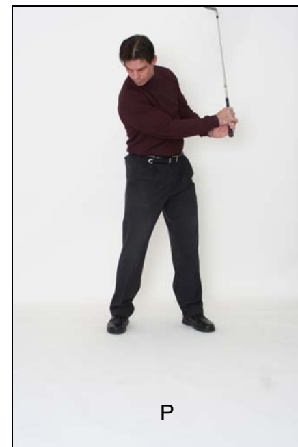
No body rotation-Arm swing