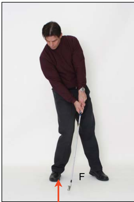
No wt transfer to front foot