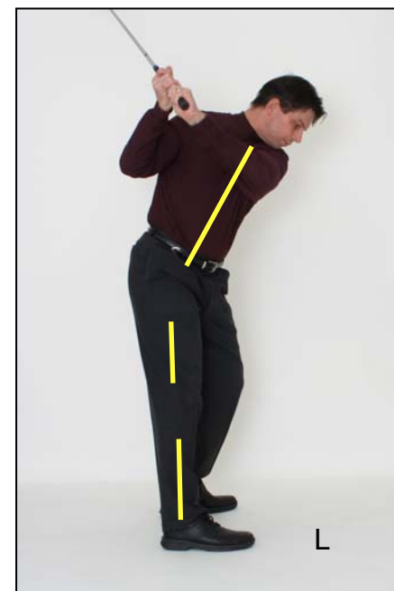
Back Straight leg-reverse pivot