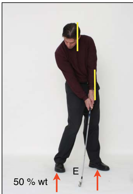
Normal Ball contact