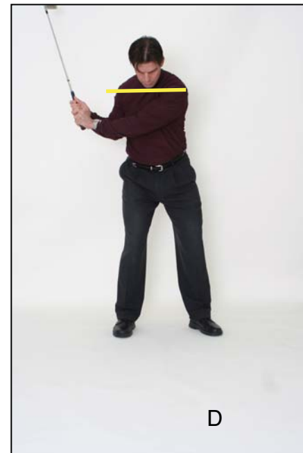
Arm Swing - No Body